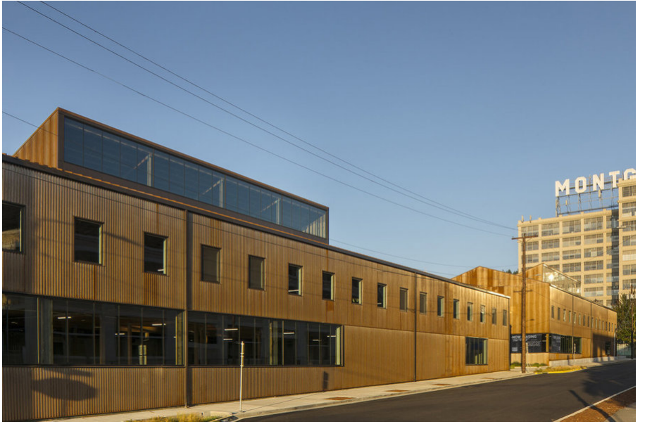
2019 AIA Portland Honor Award: Redfox Commons, LEVER Architecture

On October 25, 2019, AIA Oregon members and friends gathered to celebrate design excellence at Revolution Hall in Portland, Oregon.