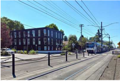
Jarrett Street 12 Architecture Building Culture