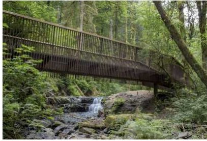
Forest Park Bridges Fieldwork Design & Architecture