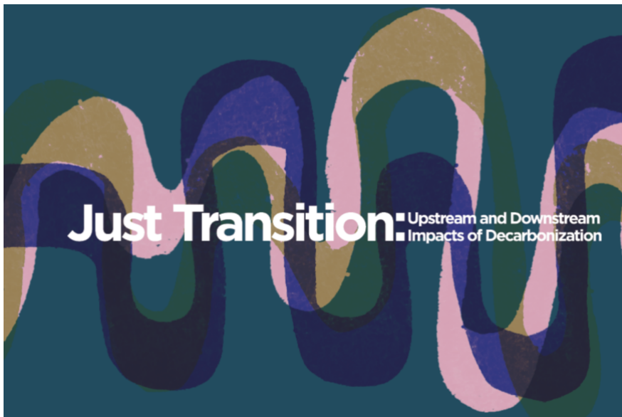
"Just Transition: Upstream and Downstream Impacts of Decarbonization"