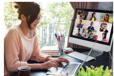
Energy Trust of Oregon AIA Oregon Gold Partner

"Supporting Today's Innovators and the Leaders of Tomorrow"