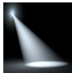
New 2020 AIA Oregon Fellows